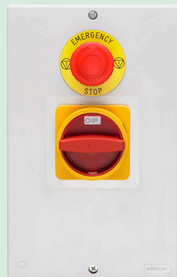
IP66 Disconnecter switch with Emergency Stayput Stop Pushbutton